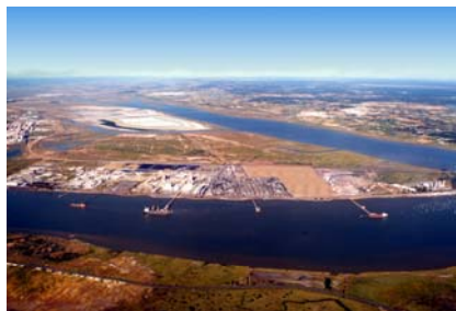
Radionuclide Migration into Phosphoric Acid and Phosphogypsum