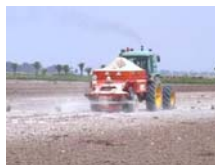
Large-scale agricultural application - Brazil